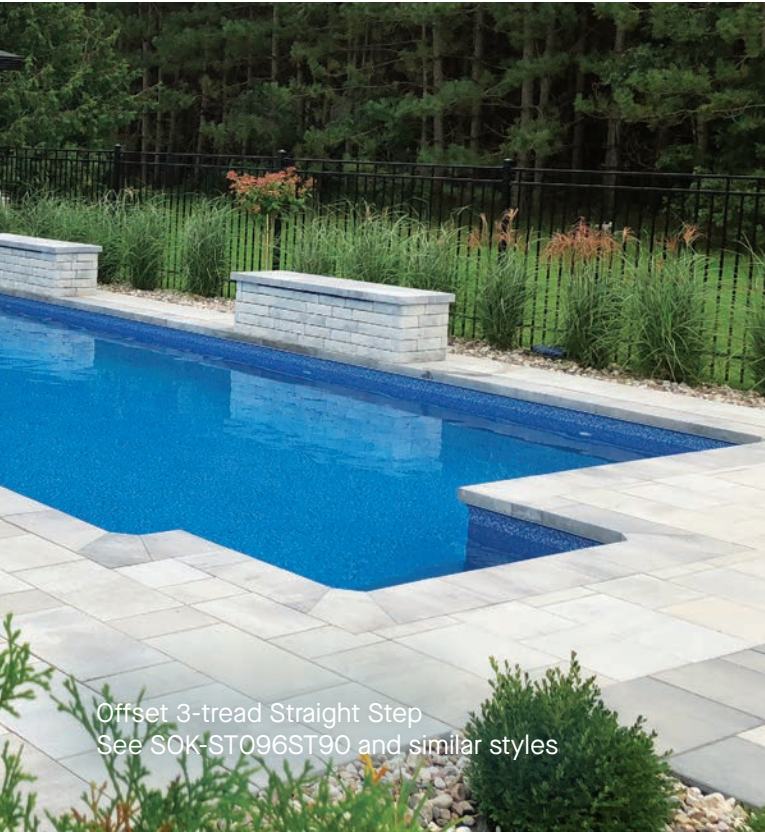
Offset 3-tread Straight Step See SOK-ST096ST90 and similar styles