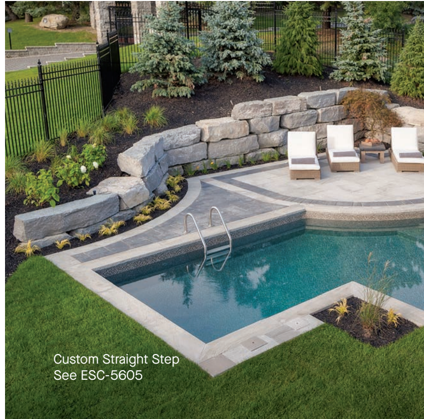
Custom Straight Step See ESC-5605