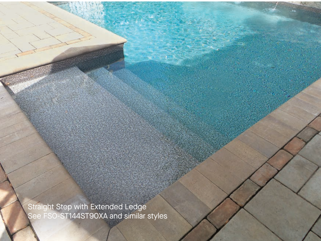
Straight Step with Extended Ledge See FSO-ST144ST90XA and similar styles