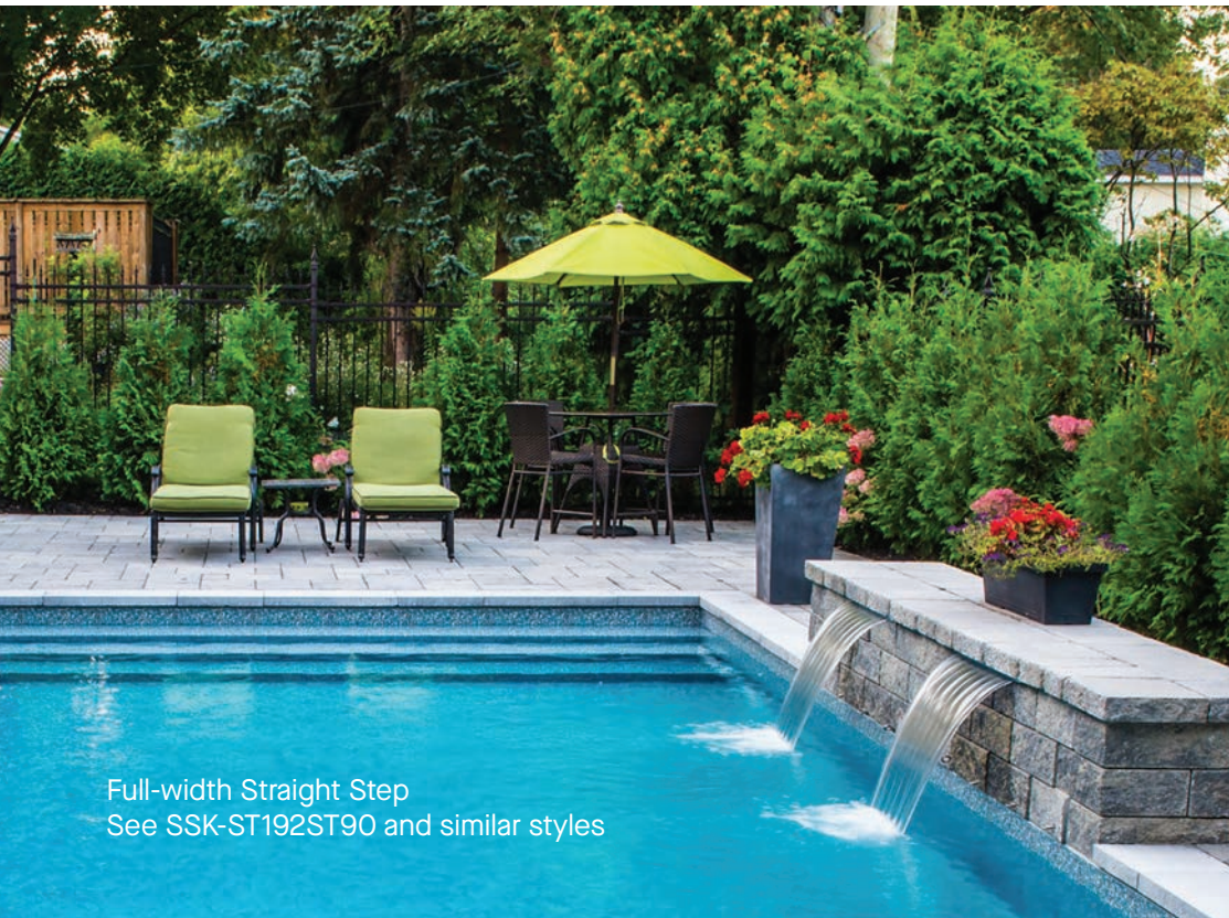
Full-width Straight Step See SSK-ST192ST90 and similar styles