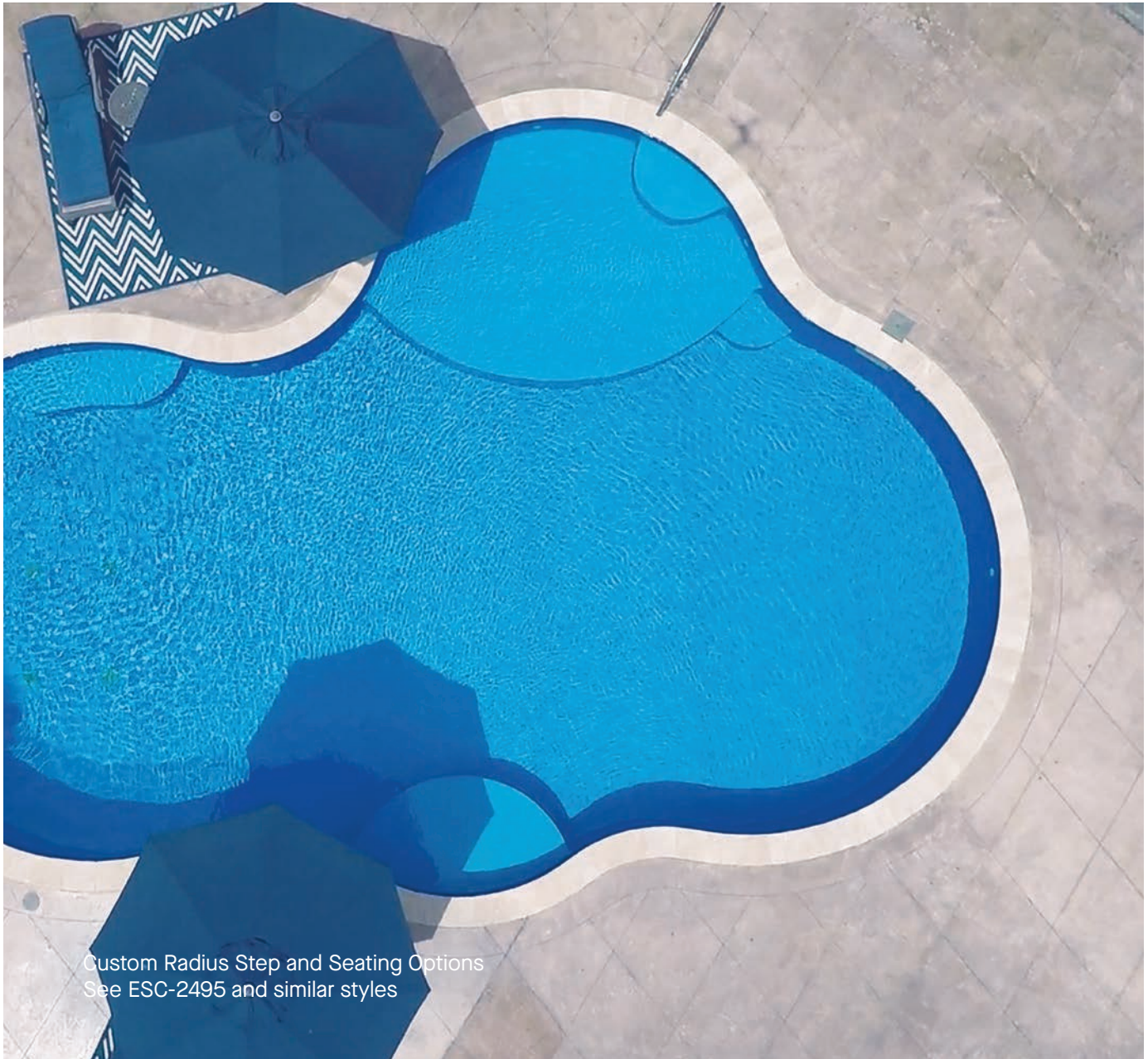
Custom Radius Step and Seating Options See ESC-2495 and similar styles

Latham vinyl over steps offer unlimited possibilities. Your Latham dealer can help you select from our best selling standard options or customize steps, seats, and ledges that work for your ideal backyard lifestyle.